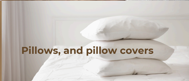
Pillows, and pillow covers